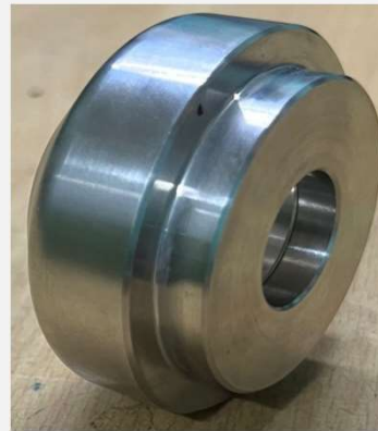
Aerator Wear Ring Customer – CRI (Coimbatore)