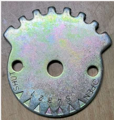
Notched Indicator Customer – L&T (Coimbatore)