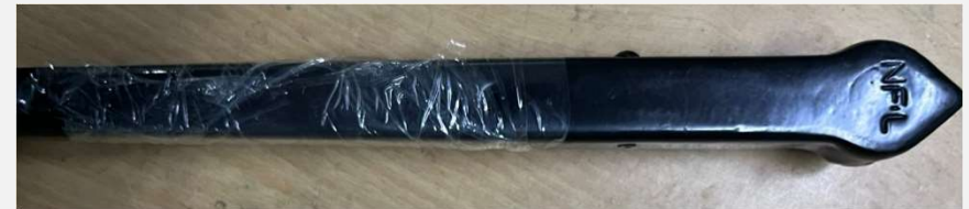
Handle 100 – 125 PN 10 Customer – NFL (Coimbatore)