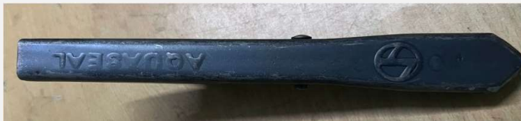
Handle 50-80 PN 10 Customer – L&T (Coimbatore)