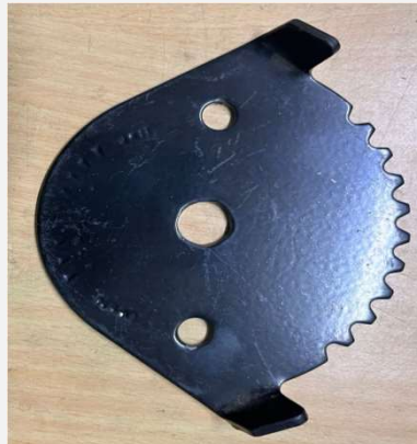
Notched Indicator Customer – NFL (Coimbatore)