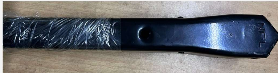
Handle 100 – 125 PN 16 Customer – NFL (Coimbatore)