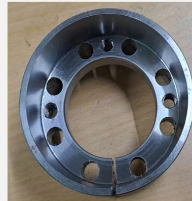
Locking Device 1 Customer – CRI (Coimbatore)