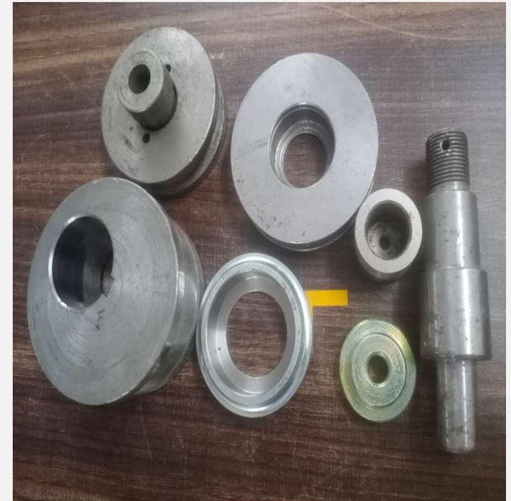
Other Machined Parts