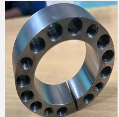
Locking Device 2 Customer – CRI (Coimbatore)